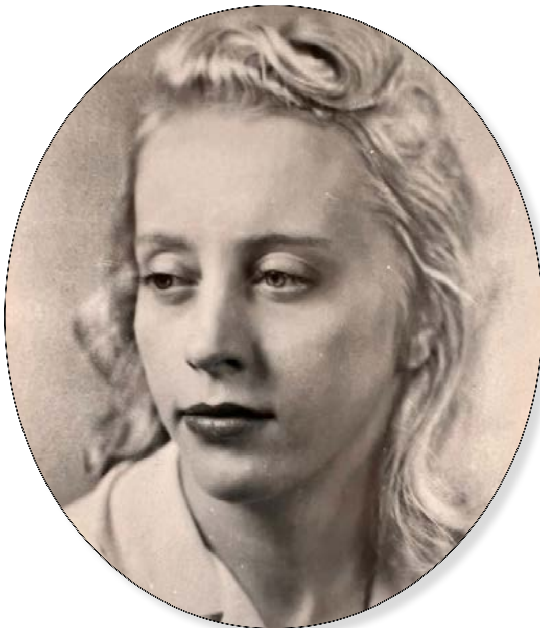
Jórunn Viðar (1918-2017)